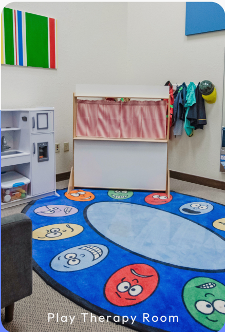
Play Therapy Room