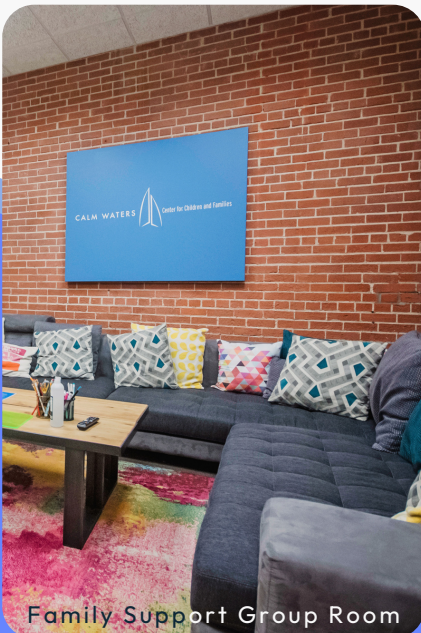
Family Support Group Room

Where our adult participants meet with others going through a similar loss