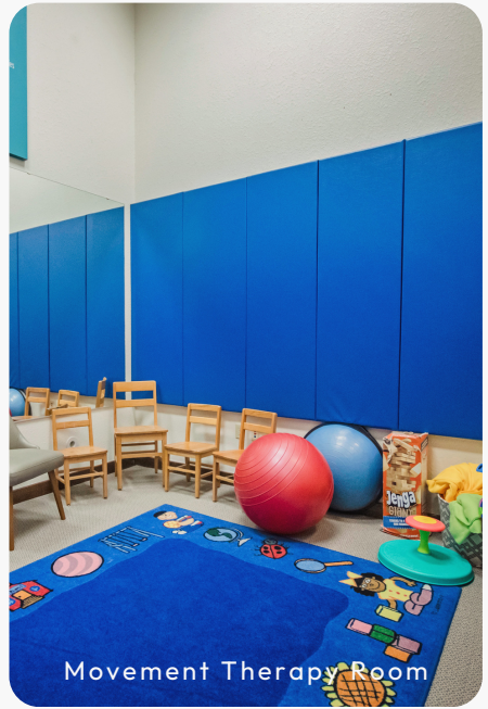
Movement Therapy Room