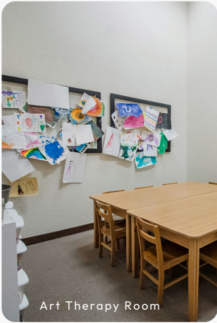
Art Therapy Room