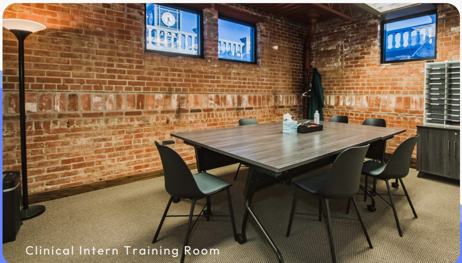
Clinical Intern Training Room

Where future licensed social workers help develop curriculum, orient new participants to the support group programs and become trained in grief-focused social work